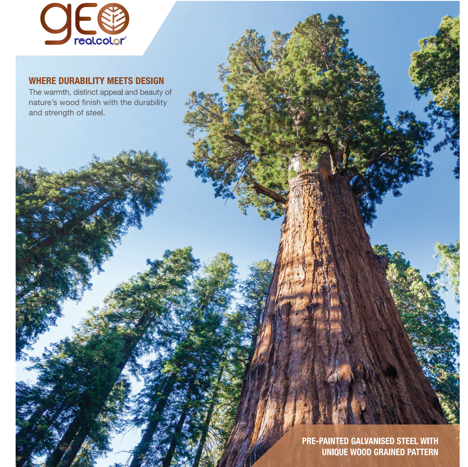
PRE-PAINTED GALVANISED STEEL WITH UNIQUE WOOD GRAINED PATTERN

WHERE DURABILITY MEETS DESIGN The warmth, distinct appeal and beauty of nature's wood finish with the durability and strength of steel.