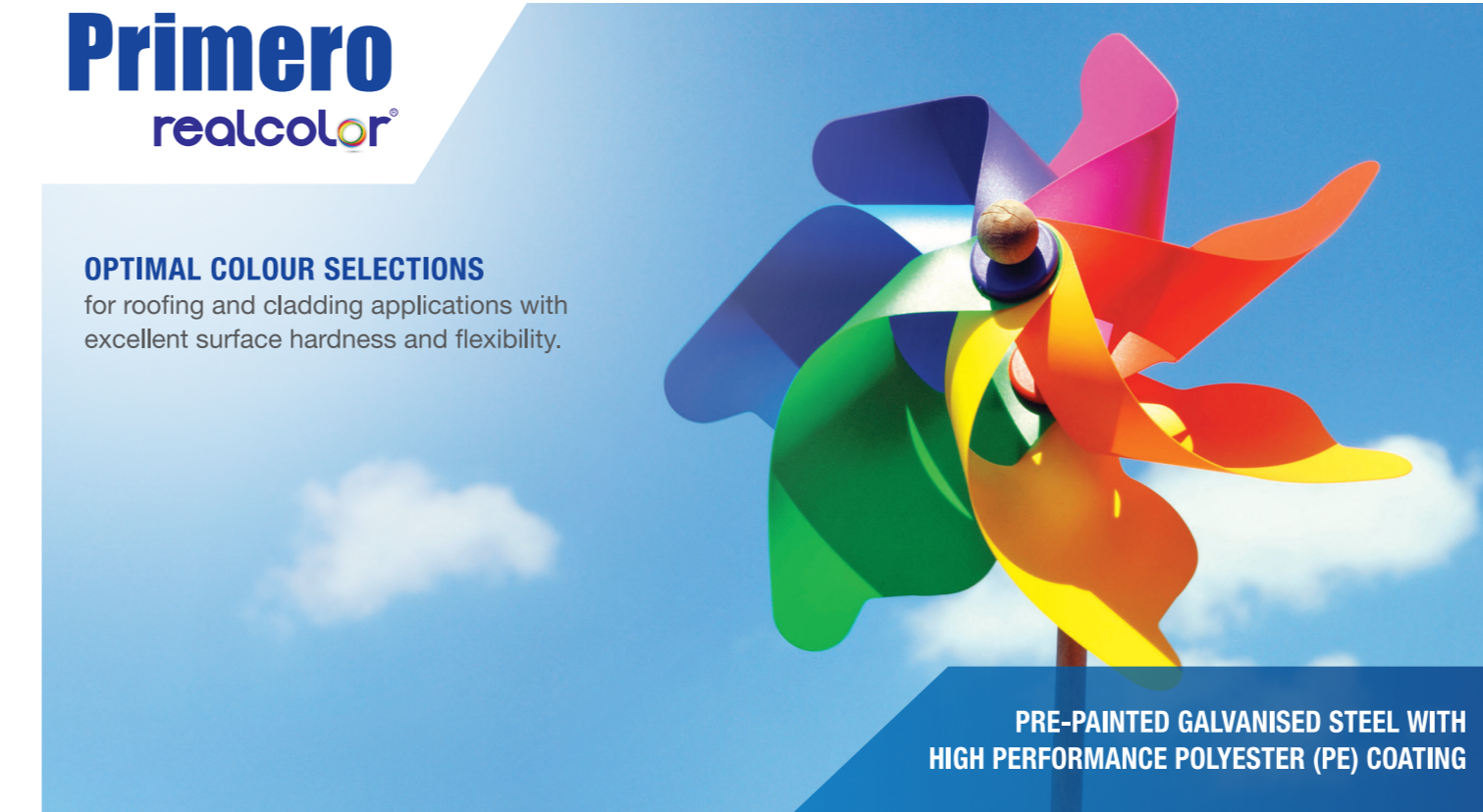
PRE-PAINTED GALVANISED STEEL WITH HIGH PERFORMANCE POLYESTER (PE) COATING

OPTIMAL COLOUR SELECTIONS for roofing and cladding applications with excellent surface hardness and flexibility.