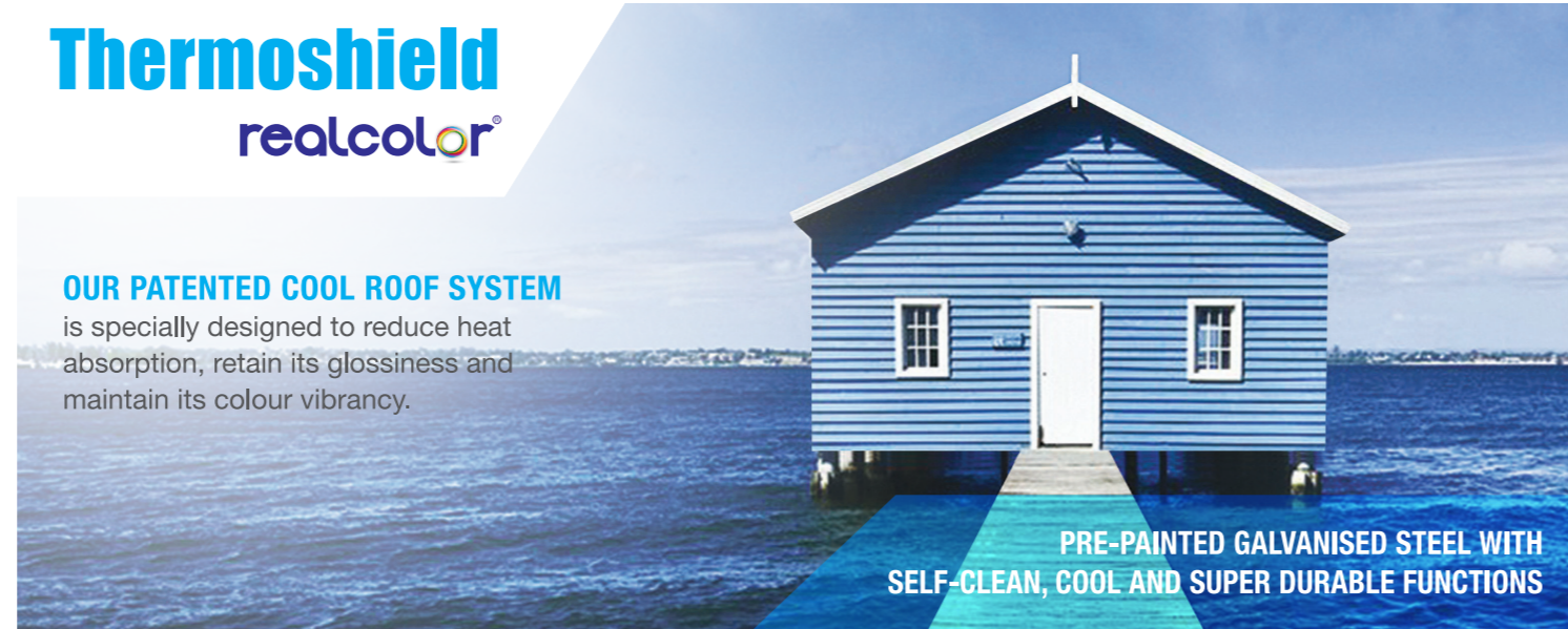
PRE-PAINTED GALVANISED STEEL WITH SELF-CLEAN, COOL AND SUPER DURABLE FUNCTIONS

OUR PATENTED COOL ROOF SYSTEM is specially designed to reduce heat absorption, retain its glossiness and maintain its colour vibrancy.