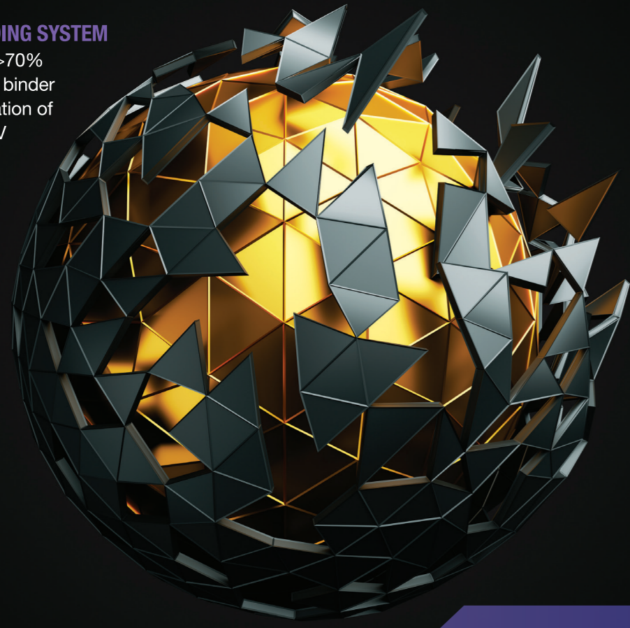
PRE-PAINTED GALVANISED STEEL WITH PVDF

ULTIMATE ROOFING & CLADDING SYSTEM Our flagship system contains >70% Polyvinylidene Fluoride (PVdF) binder which offers a unique combination of excellent outdoor durability, UV protection, formability and chemical resistance.