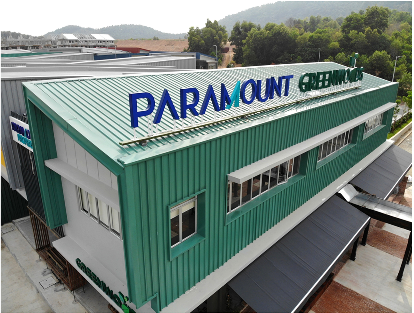
Paramount Greenwoods Belian, Salak Perdana.

after all, one of the established realcolor 's range of excellent roofing. Known for its range of colour-vibrant material and tough resistance, customers mainly choose Primero realcolor ® based on the following advantages:-