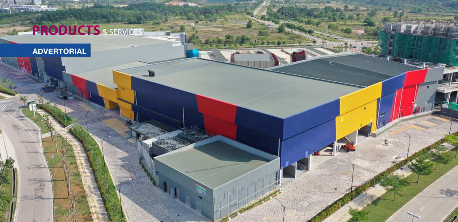
Sunway Big Box Retail Park.