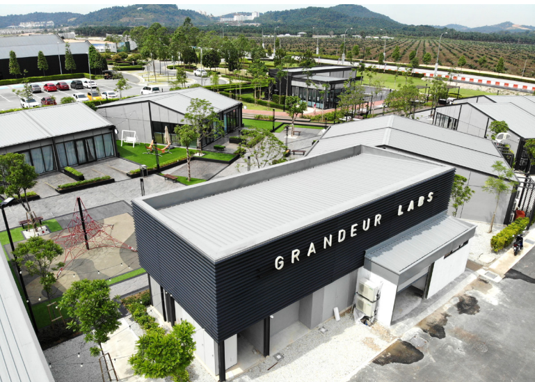
Eco Grandeur, Puncak Alam, Selangor.

Be it a contemporary, modern, or traditional architectural design, steel roof colours can be chosen carefully to match any style of building. Brownish or burgundy toned metal roofs would suit the Mediterranean style, for instance or darker grey tones for Tudorian building designs. Roof colours are the most versatile when it comes to designs according to branding or themes. One of our clients opted for vibrant roofs for their modern-styled retail and shopping space with boxy designs in Johor.